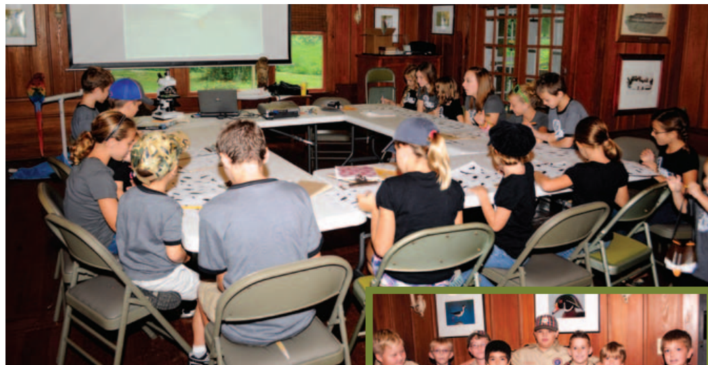
Top: Kids from the Adventure Academy participating in a bird class activity at the Street Audubon Nature Center. Right: Webelos from Pack 515 came to the Center to earn their Naturalist Merit Badge. They learned about plants, animals and ecosystems.

But kids are not the only ones who benefit with our programs. Several programs aimed for the adult community have been designed. Topics covering birds, butterflies, climate change, migration, hummingbirds, ecosystems,