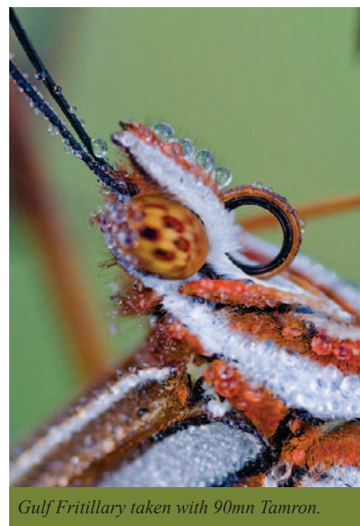
Gulf Fritillary taken with 90mm Tamron.

What happens in Central Florida in the summertime? It gets hot, humid and the birds become scarce. What does an outdoor photographer do? Being a Florida native, I do not go north. I break out the focusing rail and macro lens and go bug hunting. I usually start about sunrise to get the bugs heavy with dew and much more inactive than later in the day and most importantly, the wind is usually much calmer early in the morn. Wind is the bane of the close-up photographer. Bugs are plentiful year-round, but even more so during summertime. They can be found in your yard, a park, a bush in a parking lot or anywhere. So, just get out and look.