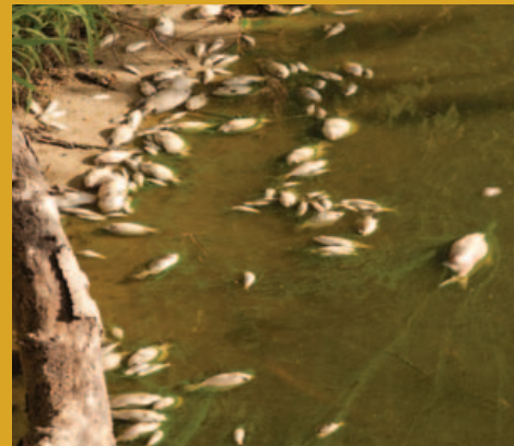
Fertilizer runoffs are linked to algal blooms which reduce the amount of sunlight reaching bottom organisms and in turn, the amount of dissolved oxygen causing massive fish kills. Areas heavily affected are called "Dead Zones". We all have a mission to avoid these effects by reducing fertilizer runoffs.

clipping. One controversial idea is banning all lawn fertilizing during the rainy season when the runoff is the most prevalent. If our lakes are to improve in water quality, the County must act now.