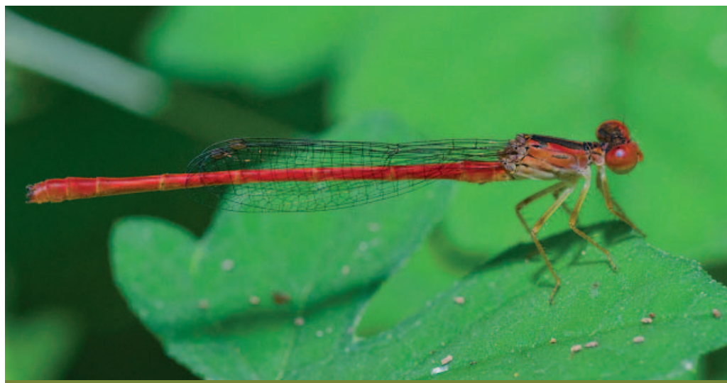
Top: Little Red Damselfly. This was taken handheld, note the black background behind the leaf. Below: Beetle, 90 mm Tamron, Nikon D7000. A handheld shot, (note the black background behind the leaf).

I load my camera with macro lens, and flash on a tripod and go hunting. I usually have a focusing rail on the camera as it helps in positioning the camera close. I like to walk the borders between high bush and grass as is found on many nature trails. When a subject is found, I try to shoot it from different angles. I have learned much about which insects will try to hide and which will pose for the camera. I have learned some tricks of the trade such as wiggling your fingers behind a bug to get it to move to the front of a twig. I like to photograph what I find, in place, this requires getting low and sometimes lying on the ground. When I am shooting a fast moving bug, the camera comes off the tripod and I chase the bug around. This requires