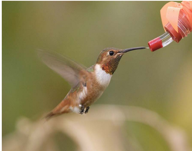
Showing Leg Band