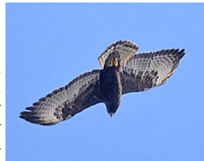
Short-tailed Hawk