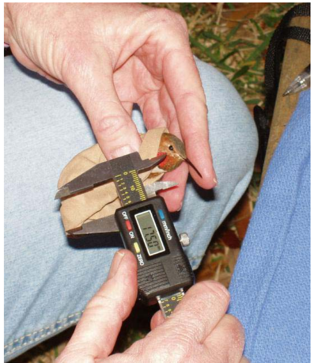
Banding