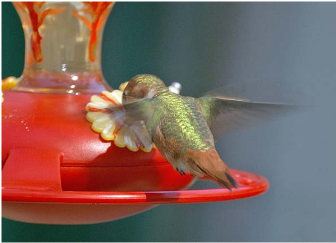
Feeding