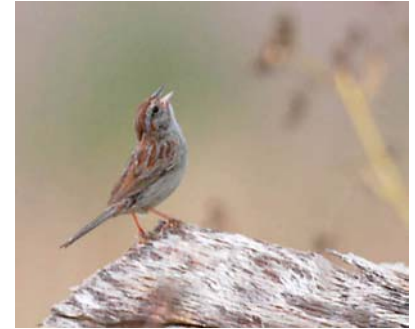
Bachman's Sparrow

Many of these differences are one time wonders and need not concern us but others are more troubling. At least a dozen unreported species in the 2008 count are from the period of the fall migration. While permanent resident populations have held up well, during the past few years the local fall migration has been weak. Just how weak it was is demonstrated by the lack of migratory birds on this count. On the brighter side both chickadees and Snail Kites have moved into the park and are breeding. There is little the park management can do about the migration patterns but they can have a good deal of influence on habitat protection of the permanent residents. With that in mind I want to focus on several species that live in the park full time.