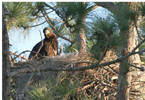
Eagles on the nest at Lake Howard Park, Winter Haven