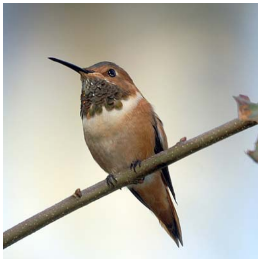
Resting