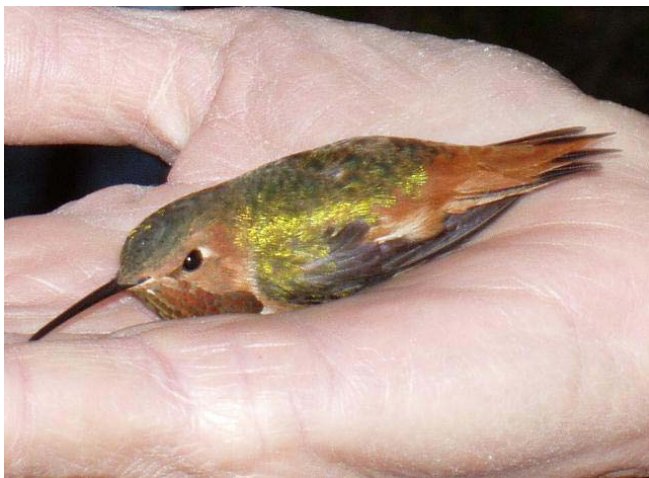
Banding